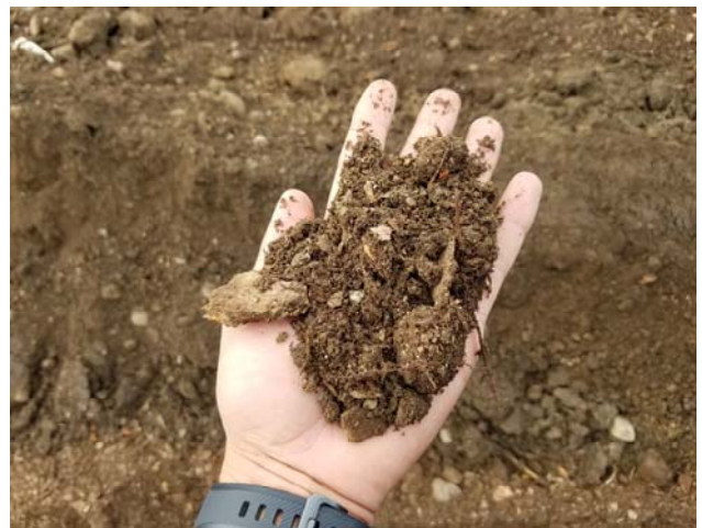
Material with too many organics (bark, topsoil, branches, etc) isn't good for road building and needed to be removed.

We understand travel through this area right now is inconvenient. Such is the nature of road construction, especially for a project this large. If you can't take an alternate route, we ask for your patience as you watch Seltice Way change a little each day.