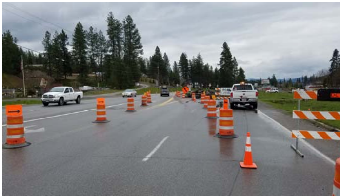
For Phase 2 of construction, traffic will shifted from the north lanes to the south lanes.

Then, during the week of July 17th, crews will start paving the shared-use path and the first layer of asphalt on the eastbound lanes!