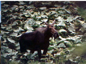
If you're lucky, you'll spot wildlife along the trail.