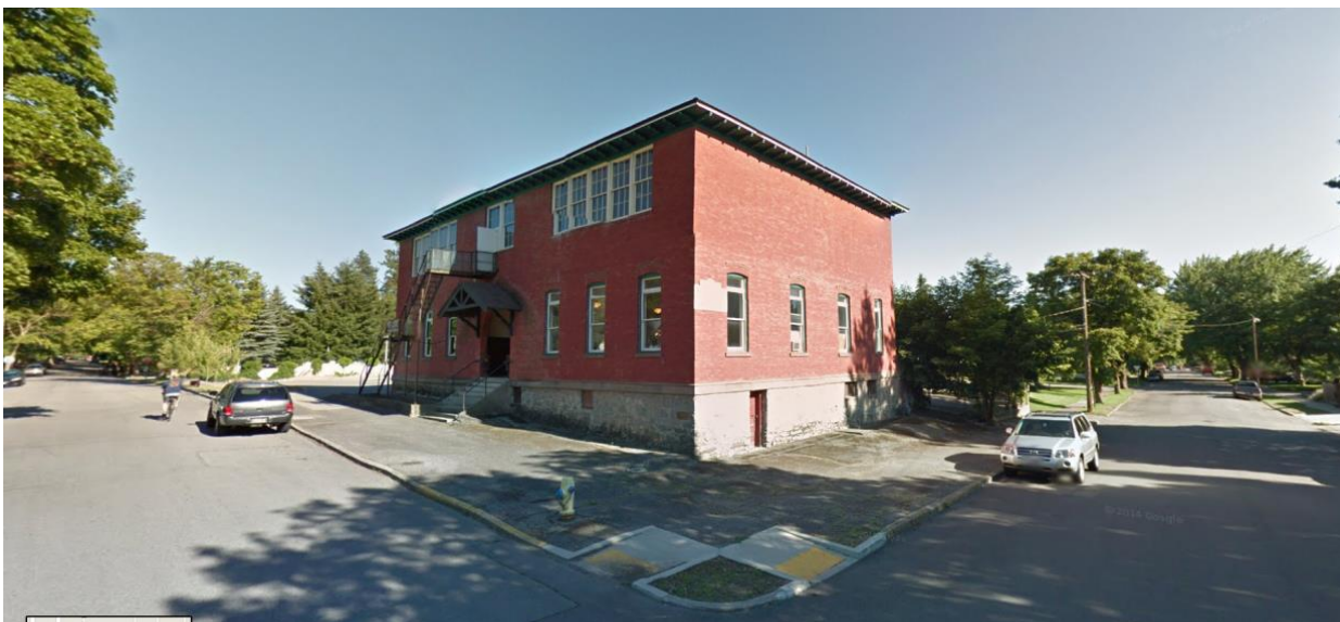
SUBJECT PROPERTY: Looking southeast

The proposed zone change will not impact traffic generation from the subject property.