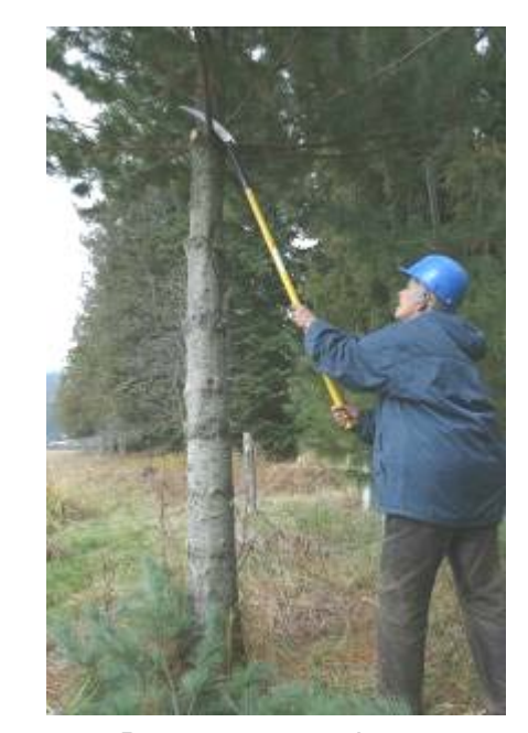
Proper tree pruning