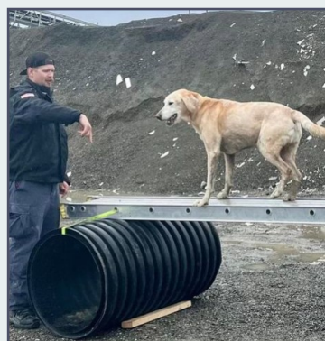
K9 Scout practicing agility