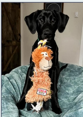
K9 Doc growing up fast