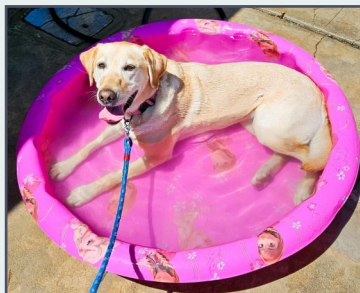
K9 Lady cooling off between searches