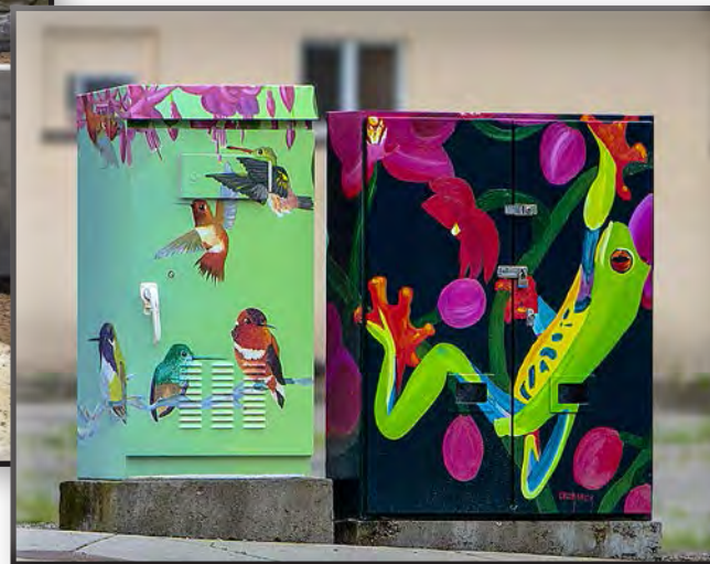
Coeur d'Alene Installations