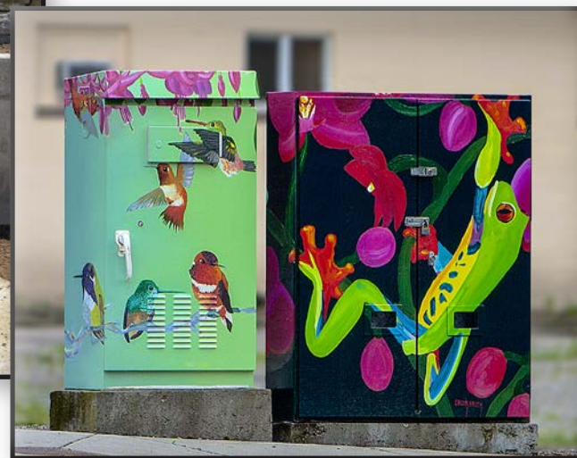
Coeur d'Alene Installations